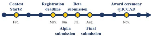
Figure 1. The contest schedules.

The contest starts in February and ends in November. The contestants need to carefully read the problem descriptions as well as reference reading from February, register for the contest by the mid of May, submit their works for alpha, beta, and final stage at June, July, and August, respectively. The final evaluation will take place after the final submission and the winners will be awarded at an ICCAD special session dedicated to this contest. The detailed schedule is shown in Figure. 1.