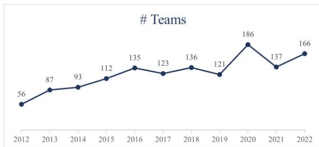
Figure 2. The numbers of registered teams where the contestants reside in from 2012 to 2022.

The contest this year receives 166 registered teams from 8 countries/regions, including Taiwan, Mainland China, Hong Kong, United States of America (USA), Korea, India, Swiss, and Germany. Moreover, 3 teams are transnational. Figure 2 shows the numbers of registered teams and Figure 3 presents the countries/regions where the contestants resides in from 2012 to 2022.